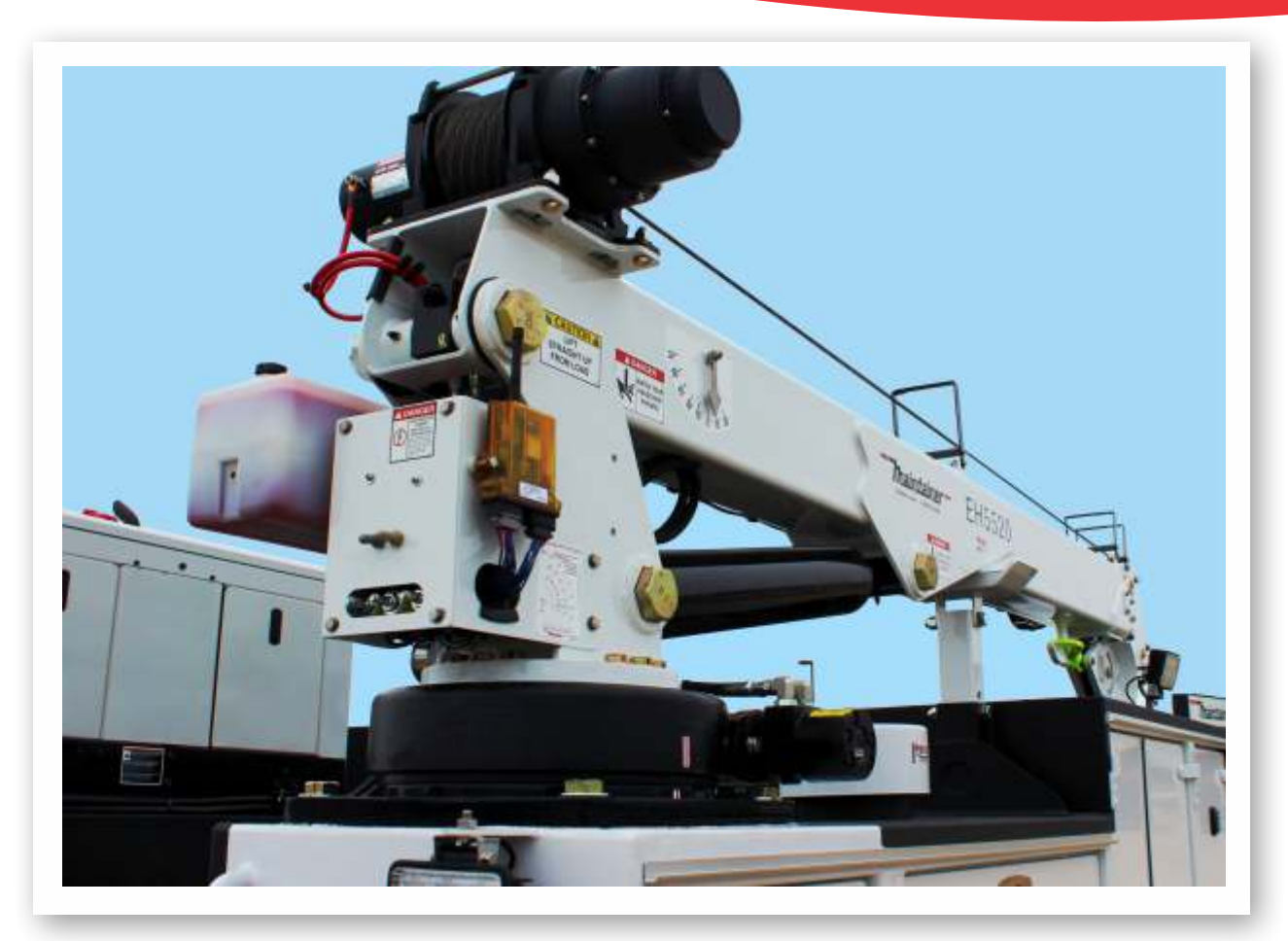
Crane shown is EH5520