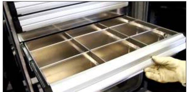
ONE CLICK locks the drawer open!